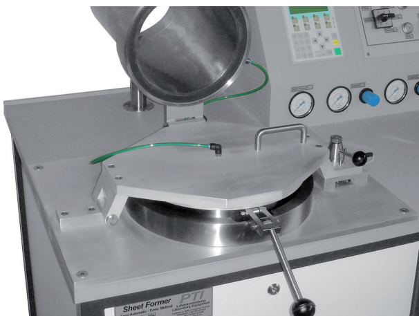
Pneumatic couching device