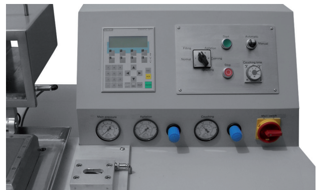
Control panel, changeable to manual control anytime